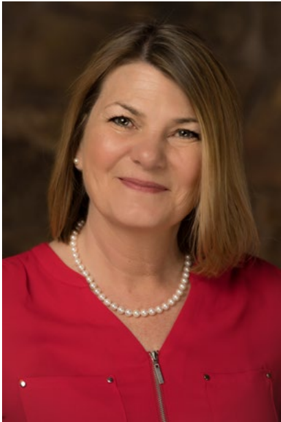
First Lady of Wyoming Jennie Gordon

W yoming Hunger Initiative was launched in October 2019 with a very specific goal in mind: to do whatever it took to support anti-hunger nonprofit organizations working tirelessly throughout the state. While this goal hasn't changed, the scope of Wyoming Hunger Initiative has grown in ways no one could have imagined. It is comparable to a car being built as it is driven down the road but the car has now traveled many miles and witnessed tremendous strides in the fight against food insecurity in Wyoming during these unprecedented times.